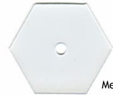
Medium - 1"