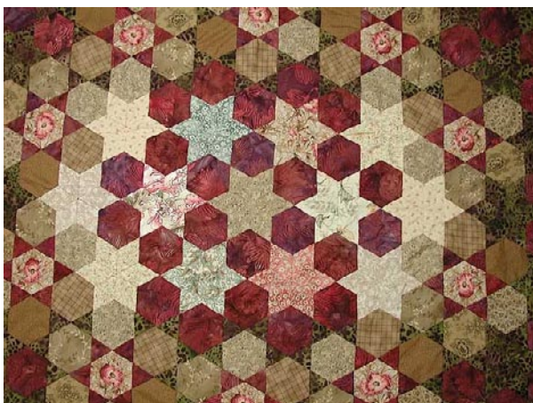
Seven Sisters and More using large hexagons and single diamonds

Please specify style ..... $19.95 per package