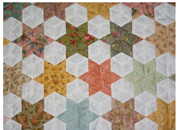
Star Struck using the double diamonds

www.quiltersfancy.ca robert@quiltersfancy.ca Tel 416 232-1199 Canada 1 800 363-3948