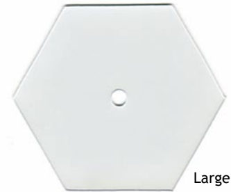
Large - 1.5"